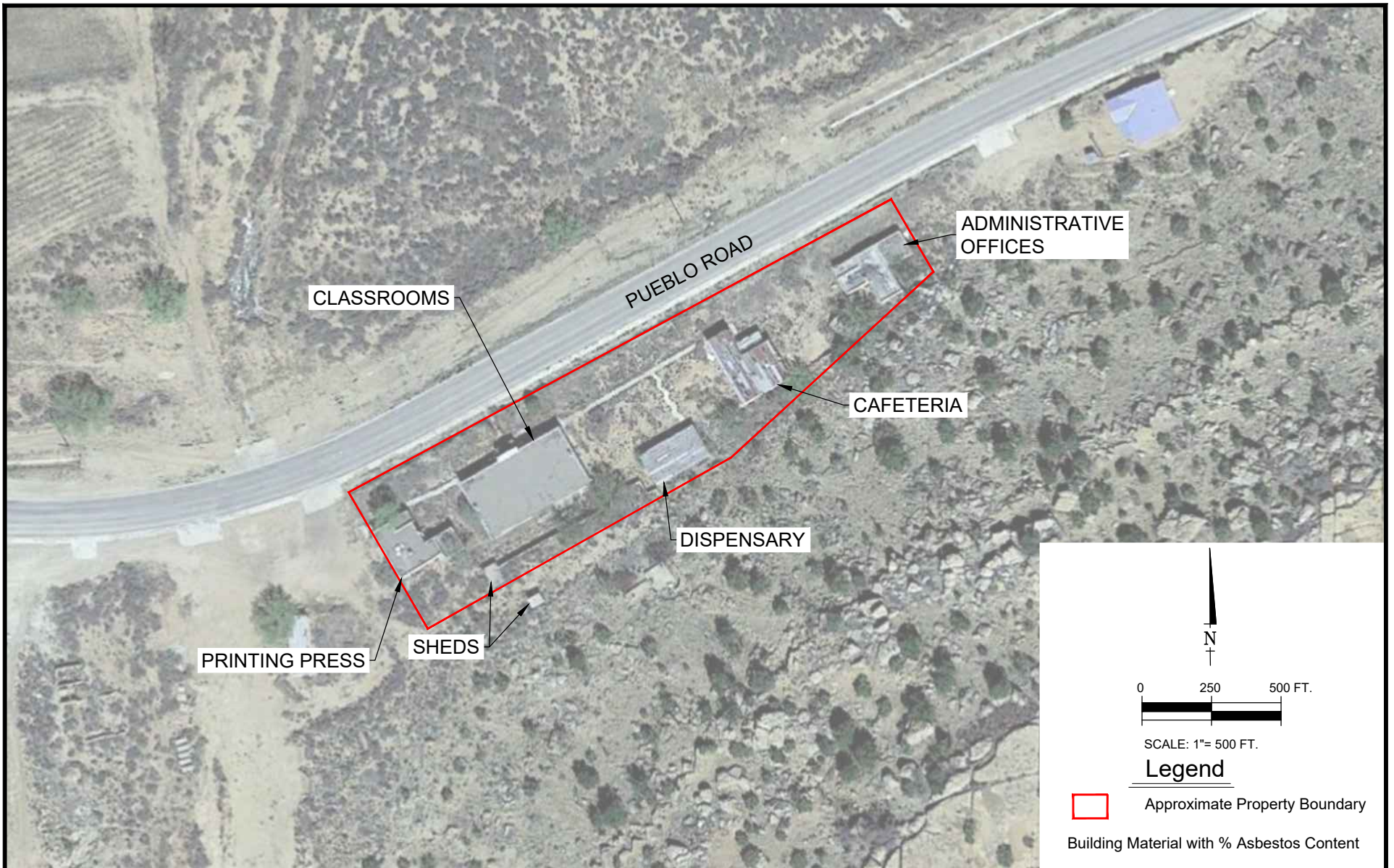
Aerial Photo Courtesy of Google Earth (Image date: 4/7/2019)